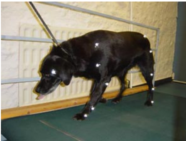
Retroreflective markers are placed on anatomical landmarks for kinematic gait analysis